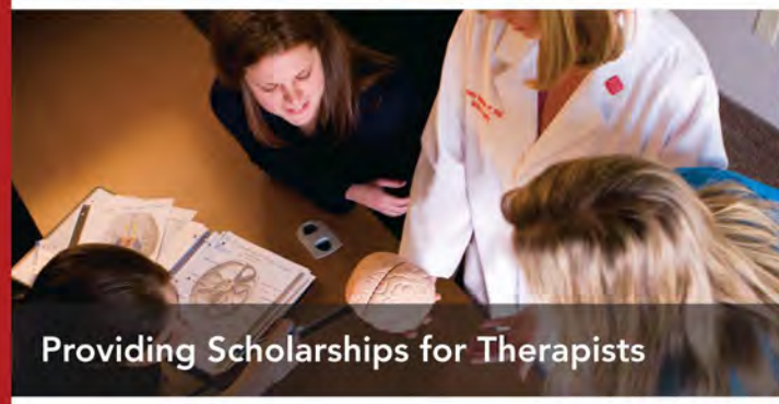
Providing Scholarships for Therapists

Thank You! Your gift is fully tax deductible! Don't forget to renew your membership on an annual basis by using your credit card. It's a quick and simple way to help "create mobility and independence for people with disabilities".