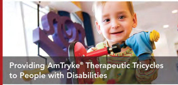
Providing AmTryke® Therapeutic Tricycles to People with Disabilities