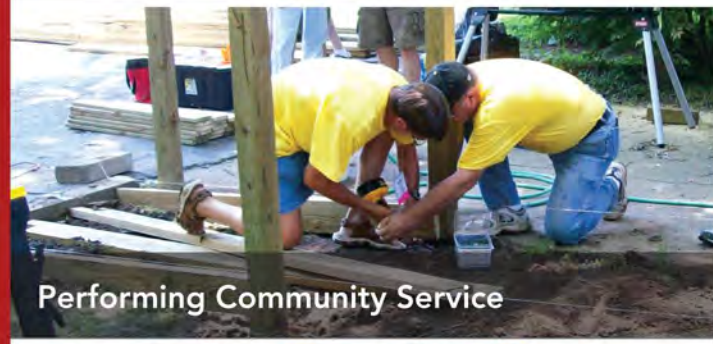
Performing Community Service

The AMBUCS™ Mission Creating Mobility and Independence for People with Disabilities by: